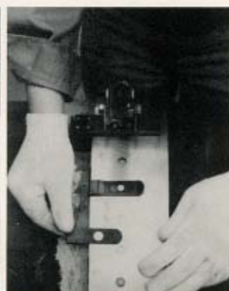
Adjusting for guide rail overlap