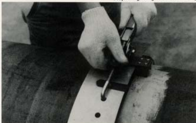
Clamping guide rail overlap