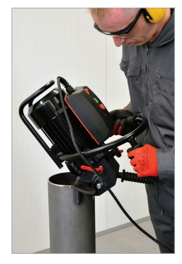
Pipe beveling (option)