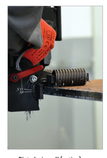
Plate facing-off (option)