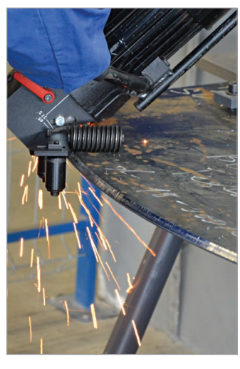
Round plate beveling (option)