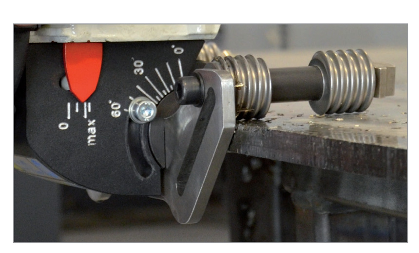
Continuous angle adjustment from 0 to 60°.