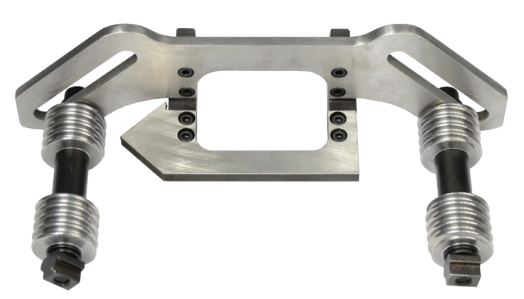
Standard universal guide plate made of Stainless Steel for beveling both plates and pipes Ø 150-300 mm (6-12")