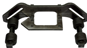
Cutting Insert (1 piece), sold 10 pcs/box Product code: PLY-000282