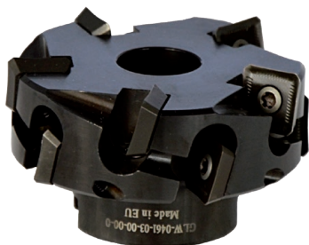
Mono block milling head, with 10 indexable inserts fixed with screws. Product code: GLW-0461-03-00-00-0

Standard universal guide plate for beveling both plates and pipes Ø 150-300mm (6-12")