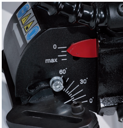
Continuous angle adjustment from 0 to 60 degrees.