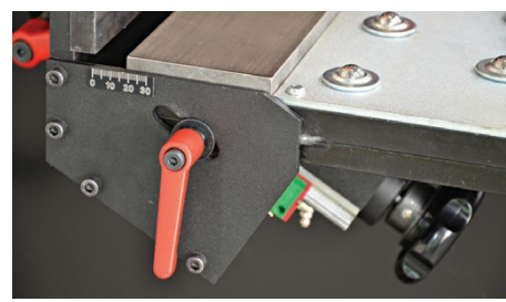
Simple setting of bevel width