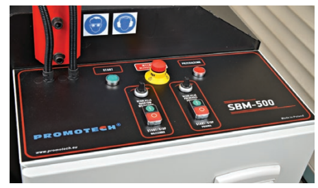
User-friendly control panel