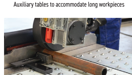
Posibility of pipe OD beveling