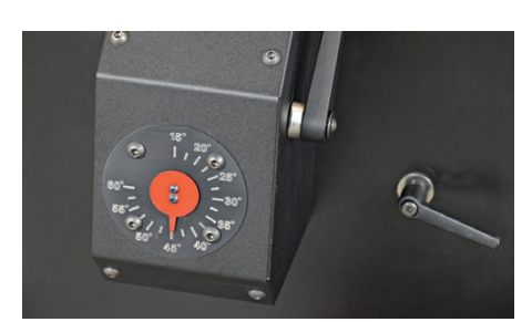
Precise bevel angle adjustment