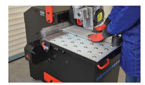
Convenient ball roller bench