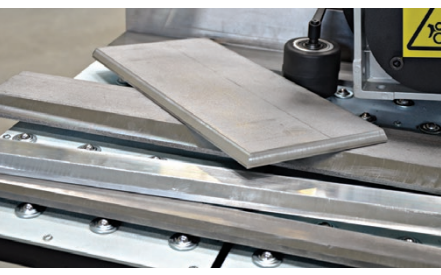
High quality bevel results