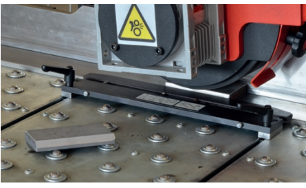
Attachment for narrow workpieces