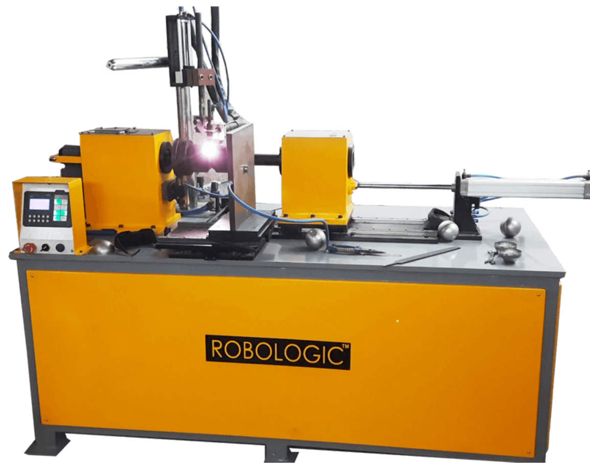
BALL WELDING SPM