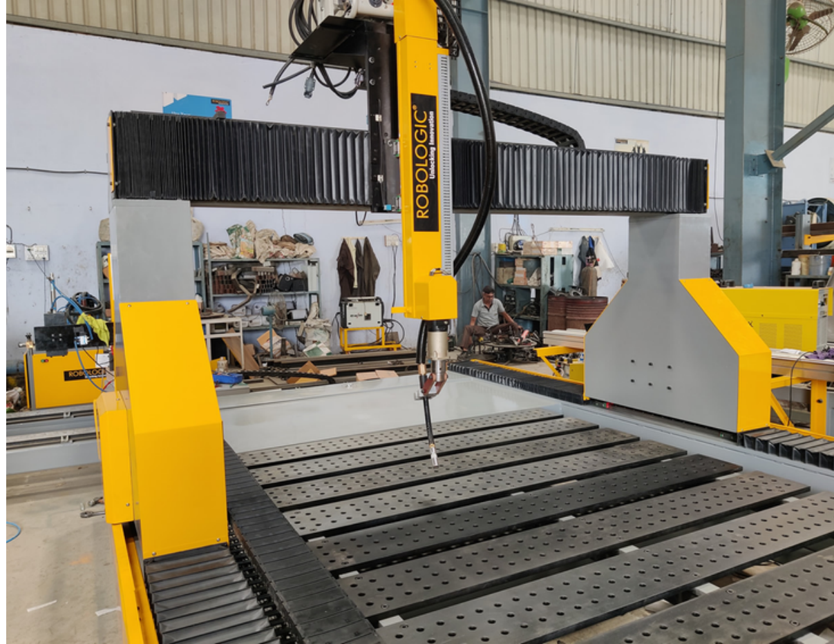
AGRICULTURAL PARTS WELDING