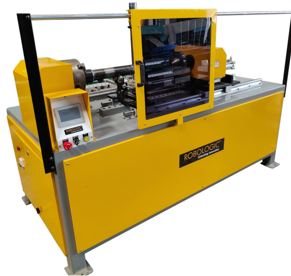
HYDRAULIC CYLINDER WELDING SPM