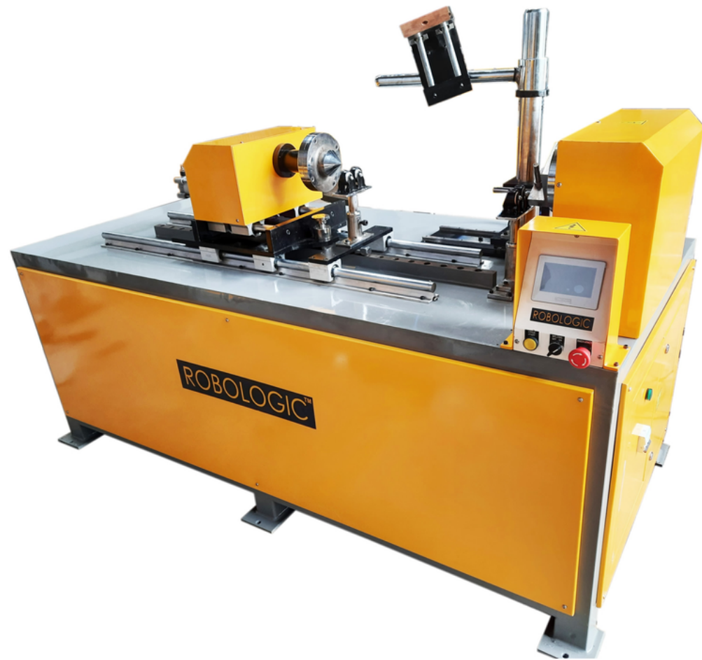
PIPE TO NIPPLE SPM