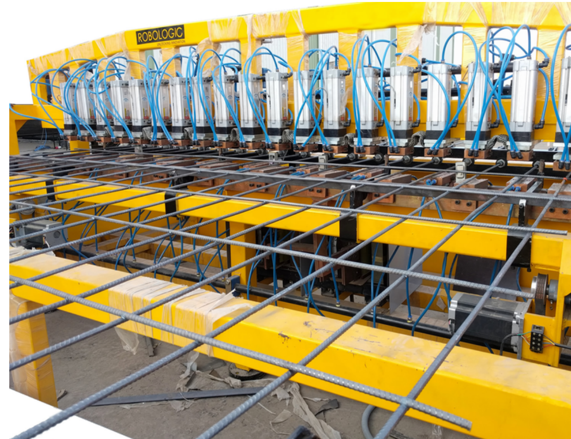
WIRMESH WELDING SPM