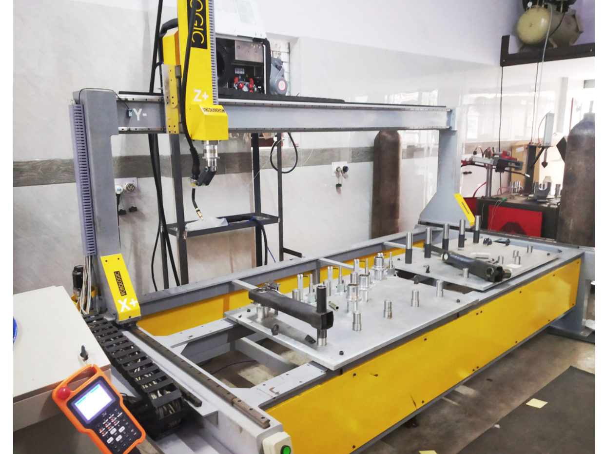
AUTOMOBILE PARTS WELDING