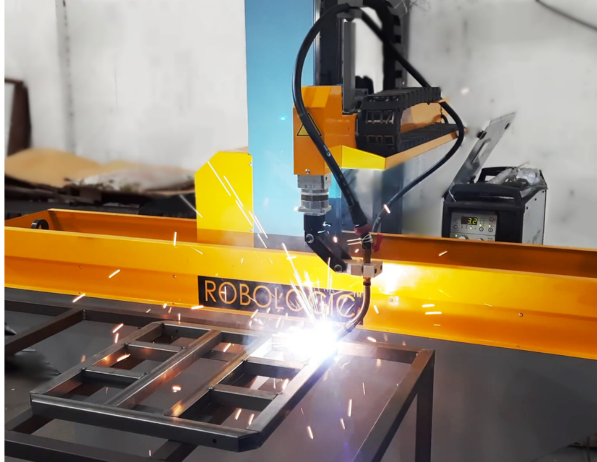
WELDING SCALE FRAME WELDING