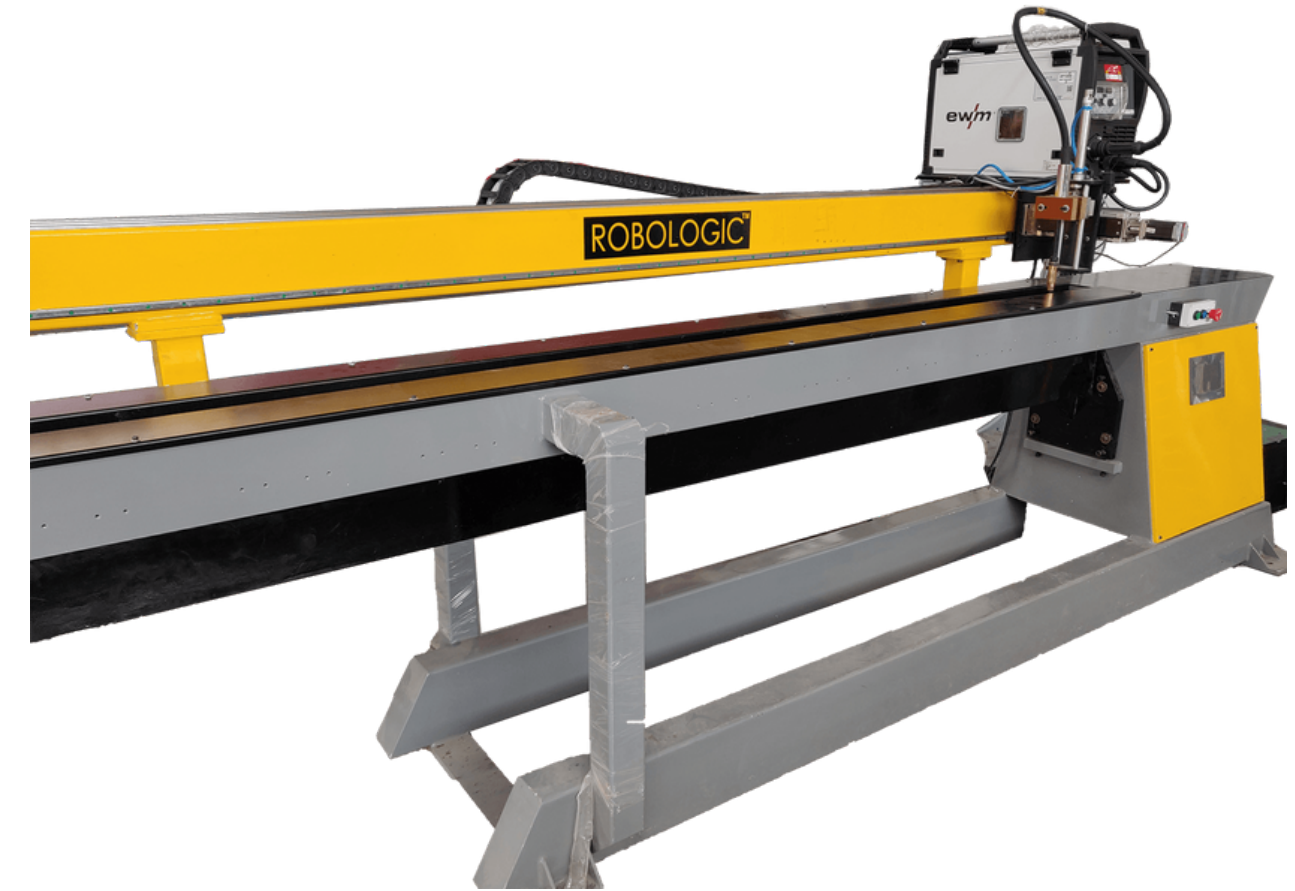
LONGSEAM WELDING SPM