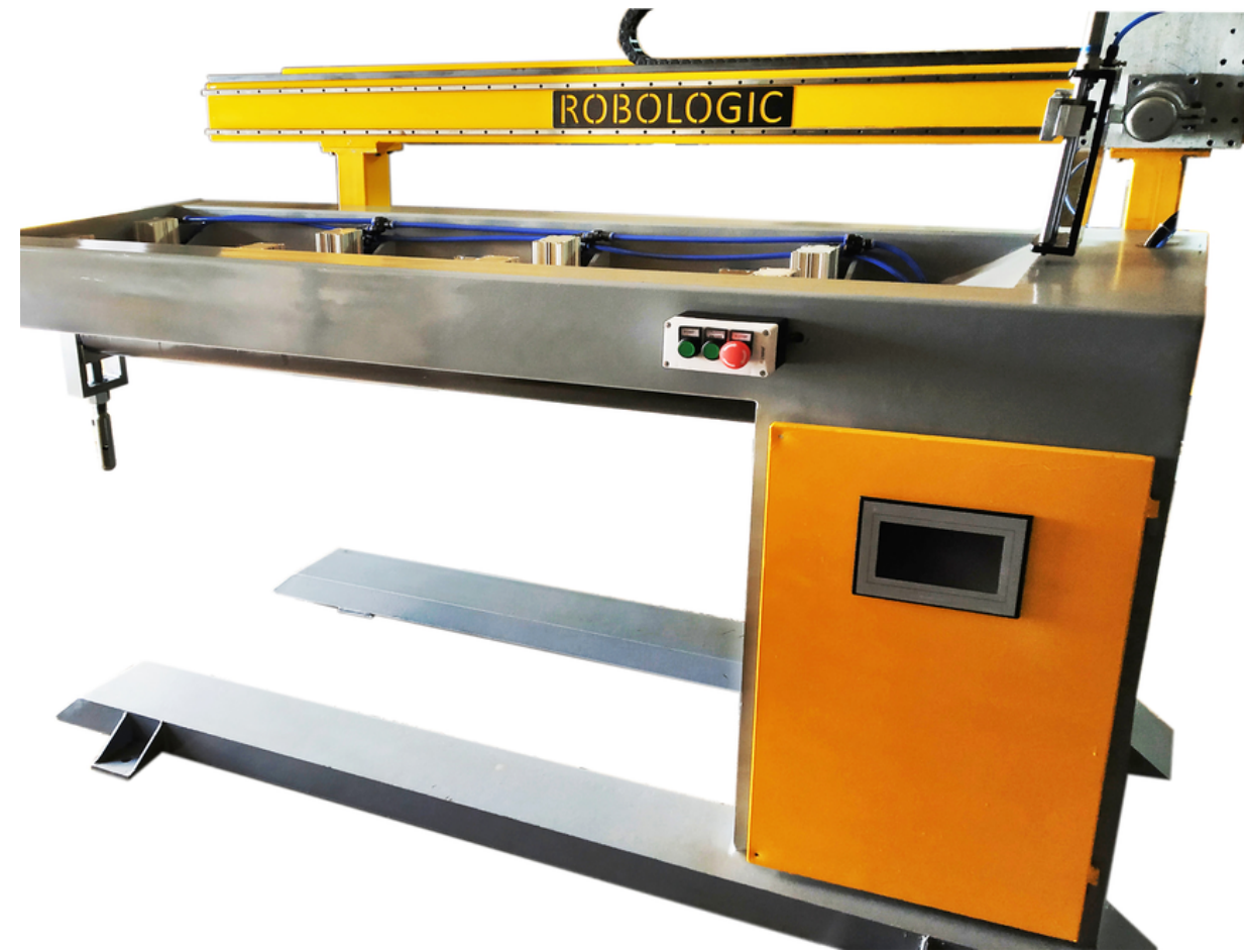
COMPRESSOR TANK WELDING SPM