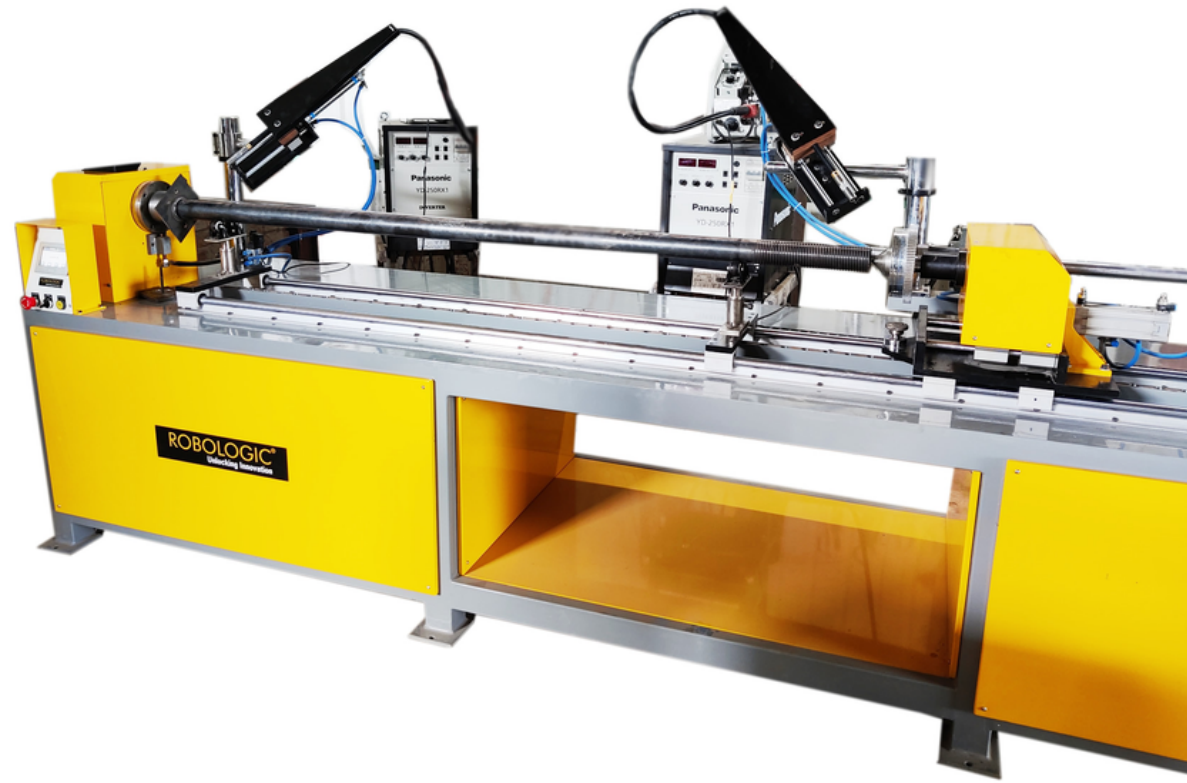
LEDGER BLADE (HORIZONTAL) WELDING SPM