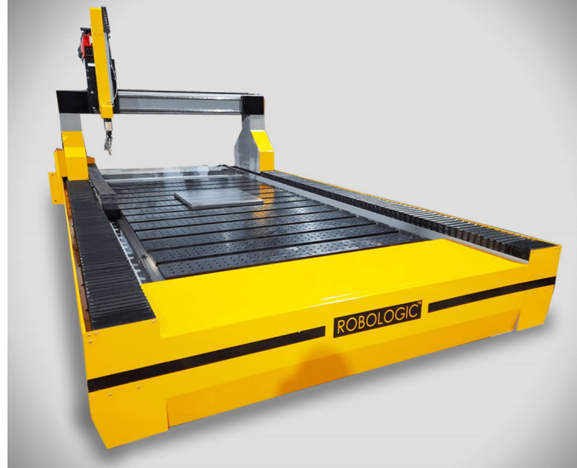
TILES MOLD WELDING