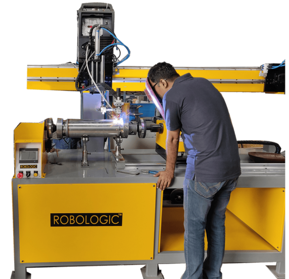
SUBMERSIBLE PUMP WELDING SPM