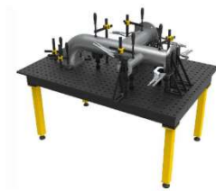
2D Welding Table

CNC machined table with flatness 0.3 mm / 1000 mm, Hole \varnothing 28 mm, Hole Pitch 100 \pm 0.038 mm, Plate Thickness 25 mm, nitriding case depth 0.01 to 0.02 mm, Surface Hardness HV 450