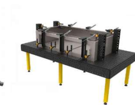
3D Welding Table