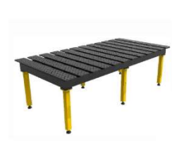
Slotted Welding Table