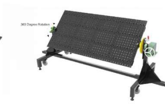
Rotary Welding Table